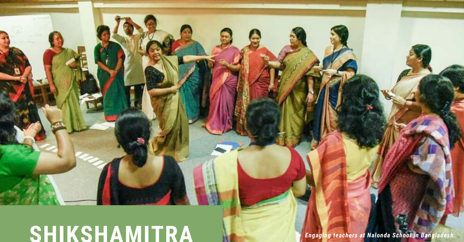
Engaging teachers at Nalanda School in Bangladesh