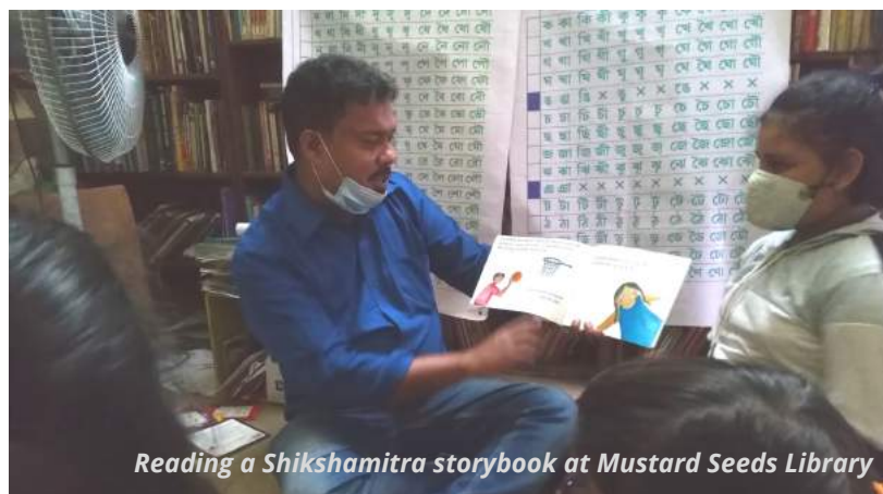
Reading a Shikshamitra storybook at Mustard Seeds Library