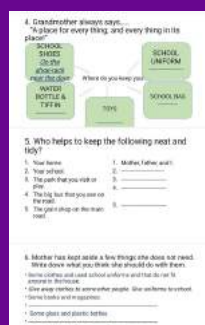
Worksheets created by participants at end of Workshop on Worksheets