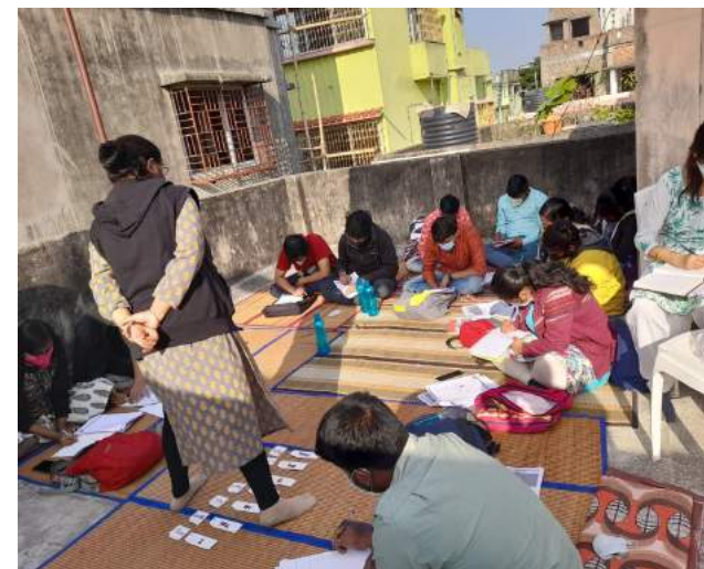
English teacher training for three civil society groups