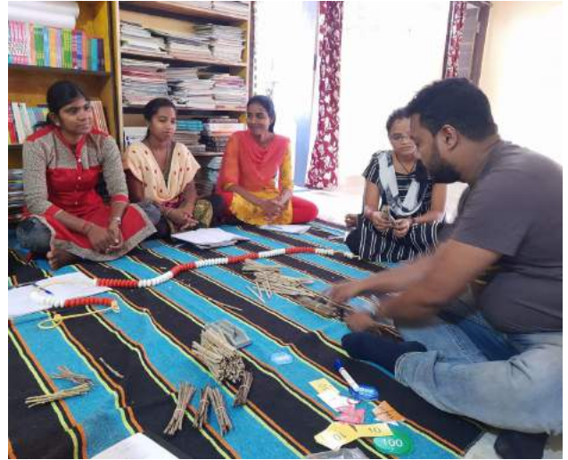
Maths follow-up session at Gramothan