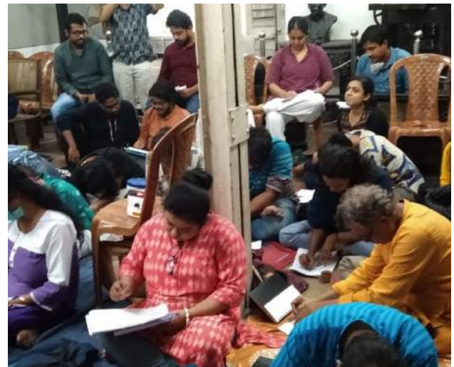
Bangla Workshop for three civil society groups