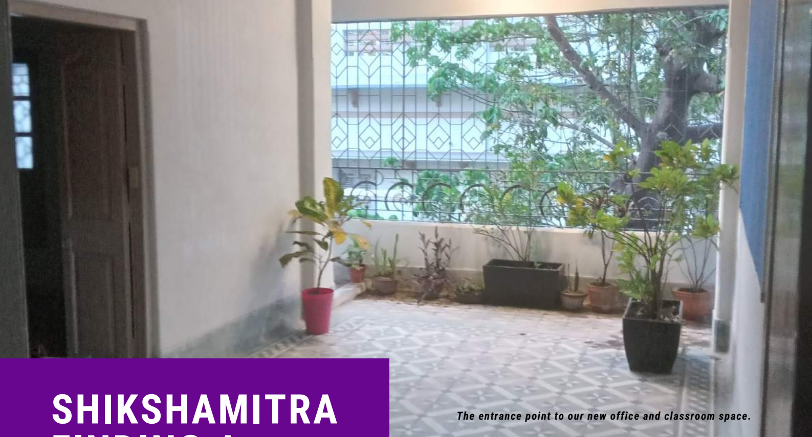
The entrance point to our new office and classroom space.