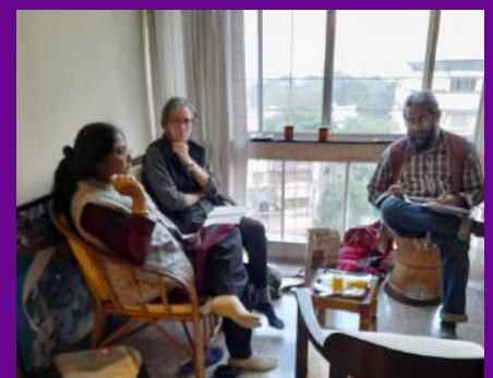
Prepping for English with Art and Music Integration